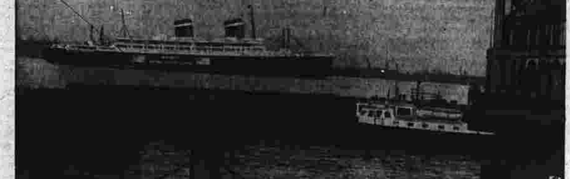
The 26,425-ton liner America, largest passenger vessel ever built in the United States, moves up the Hudson river to its Manhattan pier, ending its last cruise before being turned over to the U. S. Navy. The America was acquired by the Maritime Commission for delivery to the Navy as an auxiliary.

German High Command Reports Navy and Air Force Destroyed 746,000 Tons of Merchant Shipping Space in May—Of Total 479,000 Tons Victims of Subs, 215,000 Tons, Planes.